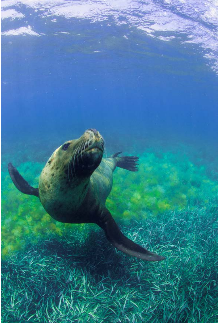
Above: sea lion swimming in the wild. Cover: A pod of spinner dolphins off the west coast of Oahu, Hawaii.

“SeaWorld was created as strictly entertainment. We didn’t try to wear this false façade of educational significance.”