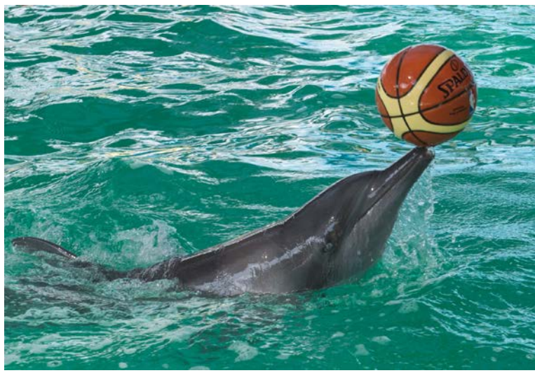
Below: Dolphins are kept captive in small pens or pools where tourists can interact with them.

World Animal Protection, AWI, and other animal protection groups maintain that a plethora of information is available clearly indicating that marine mammals do not cope well with captivity and it is impossible for marine mammals to thrive, not just survive, in such conditions. Taking animals from the wild or breeding animals in captivity for the purpose of human entertainment, despite the inherent suffering it causes for the individuals, raises serious ethical concerns. Marine mammals are denied freedom and autonomy and their captive environments provide a stressful life which has nothing in common with the life for which they evolved and adapted. Furthermore, the public display industry cannot be justified on the grounds of conservation or education value. The report concludes that it should be unacceptable for these animals to be held in captivity for the purpose of public display throughout the world. For marine mammals - such as cetaceans whose intelligence appears at least to match that of the great apes and perhaps of human toddlers (they are self-aware and capable of abstract thinking) a life in captivity is simply no life at all.